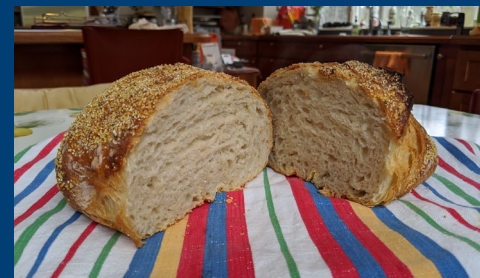
My new career – baking bread!