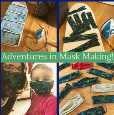
Adventures in Mask Making!

SEND YOUR SUBMISSIONS TO: RANI.ELWY@VA.GOV